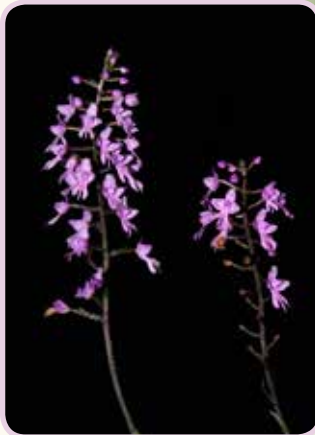
Stenoglottis (Sparkle x fimbriata)