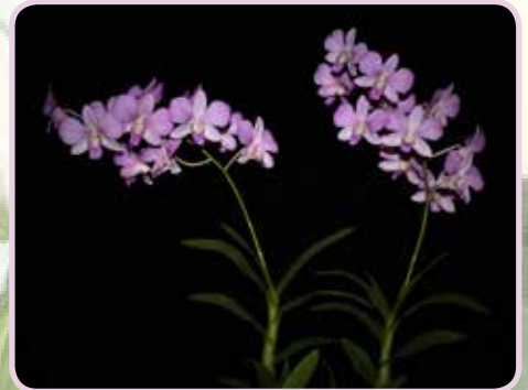
Dendrobium Mikatzu Pink