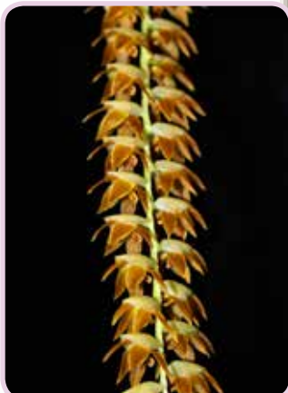
Dendrochilum magnum Grower: Kay Grace