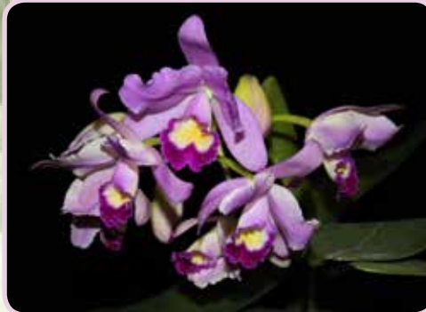
Cattlianthe Portia 'Etta Gray'