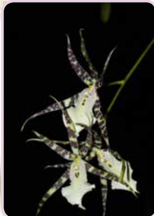
Brassidium Explorer Grower: Gregg Brill