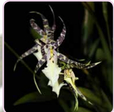
Brassidium Explorer Grower: Bev Schram