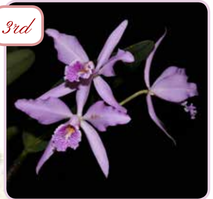
Cattleya maxima Grower: Bev Schram