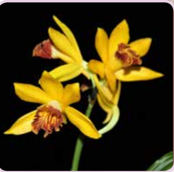
Phaius Maculato-Grandifolius Grower: Gregg Brill