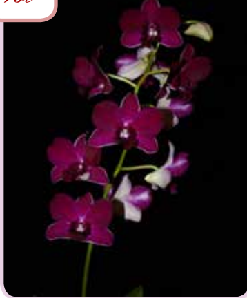
Dendrobium Kultana 'Beauty' Grower: Heino Papenfus