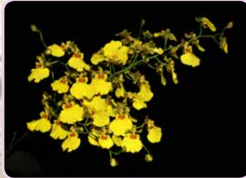
Oncidium Sweet Sugar Grower: Gregg Brill